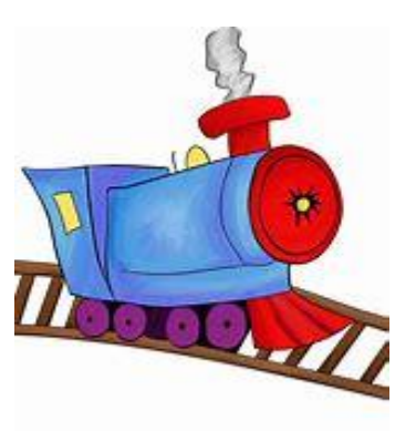
Day 4 – Sunday 4 May 2025

Early morning breakfast at a local downtown location before our return train bound for Warwick. Lunch stop will again be at the Inglewood station, arriving in Warwick late afternoon. Breakfast / Lunch / Dinner